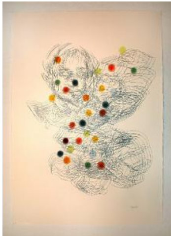
Carlos Capelan's untitled 2008 work on paper.